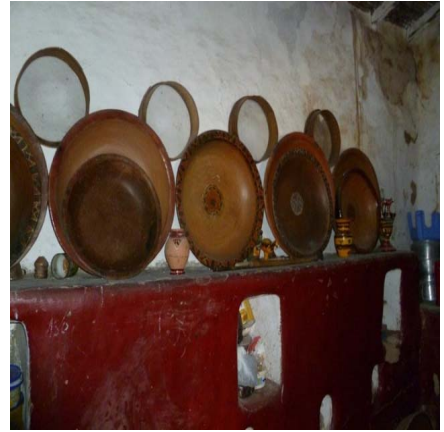
Allalen n wučči