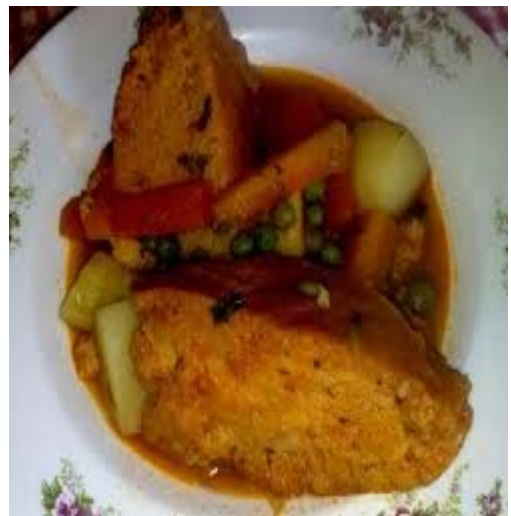
Taħbult n Imerqa