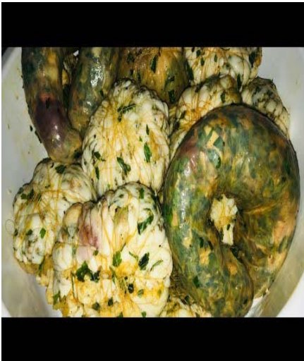
Leesban n ujyed