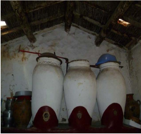
Ikufiyen deg-s nnaema