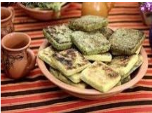
Ayrum n tecrawt