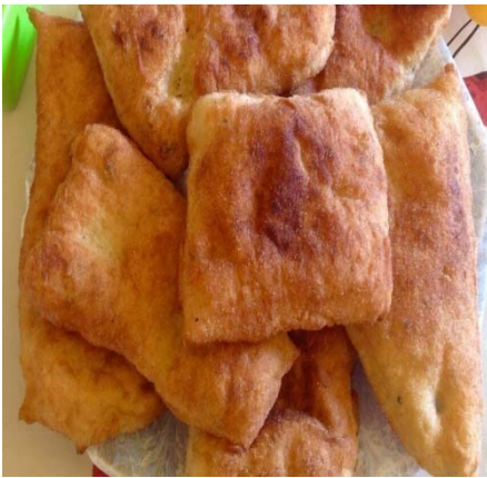
Tameqluet n zzit