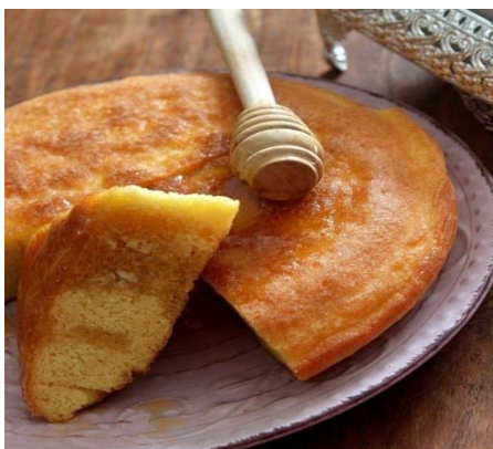
Tahbult n temllalin