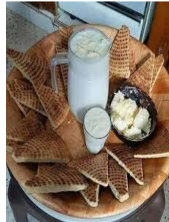
Tawaract n wudi d yiya