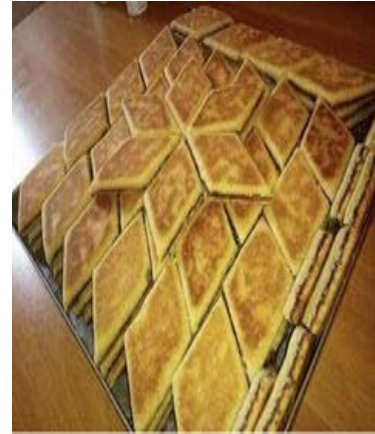
Ayrum n ttemar