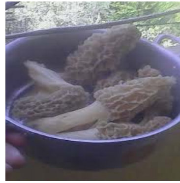
Tikerciwin n leyla