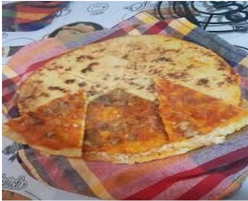
Ayrum n lexlîe