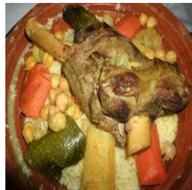
Seksu d uksum