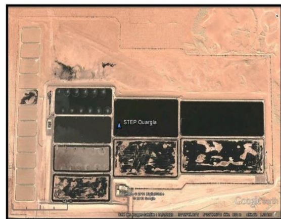
Figure 3. STWW of Ouargla

In the wilaya of Ouargla, the agricultural sector is limited; it is especially with phoenicicole vocation. On 16,323,300 ha that account the wilaya of Ouargla, 4,940,000 ha are assigned to the agriculture including 38,400 of USA divided into 35,300 ha in irrigated and 3100 ha in dryness. The purification of waste water by lagunage ventilated of Ouargla brought into service in 2009 will have a capacity for treatment of 400,000 \text{éq}/\text{hab} . at the horizon of 2030. It covers a surface of 80 ha, with 11 beds of drying, 8 basins divided into 3 levels (figure 3). The daily medium flow was of 57,000 \text{m}^3/\text{j} in 2015 and will be of 74,027 \text{m}^3/\text{j} by 2030 (table 2).