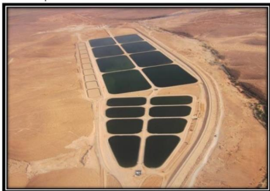
Figure 2: STWW of Ghardaïa

With the extension of surfaces, the sector of agriculture offers great developmental perspectives[5]. The purification of waste water by lagunage ventilated of Ghardaïa brought into service in 2012 is located in the commune of El Atteuf at the downstream of the valley of M'Zab. It has a capacity for treatment of 331,700 \text{éq}/\text{hab} and covers a surface of 79 ha, with 10 beds of drying, 16 basins divided into 2 levels (figure 2). The daily medium flow with rated capacity is of 46,400 \text{m}^3/\text{j} . (table 1).